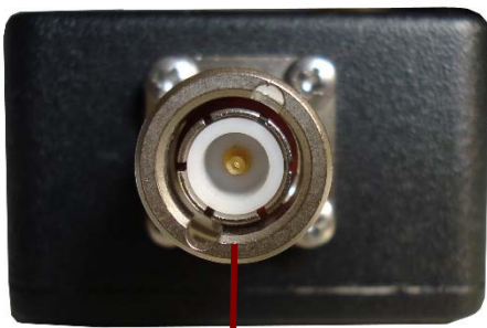
BNC input connector